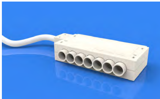
1 x Power Distribution Hub (LED-TL-LRL-TYCO6)