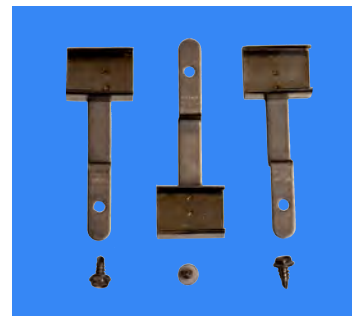
1 x Mounting brackets (LED-SPGLOBRACKET-TL)