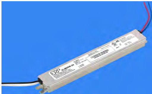
1 x Power Supply (LED-SSD-60W-POWER)