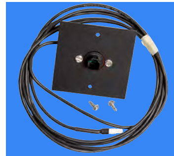
3 x Shelf Plate Assembly (LED-TL-LRLS-HARNES)